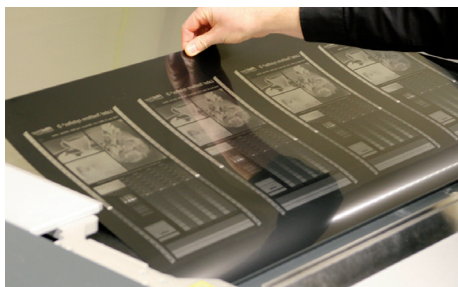
Imaging with IR-laser