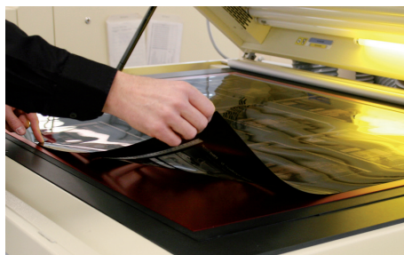
The LADF can be used without prior cleaning