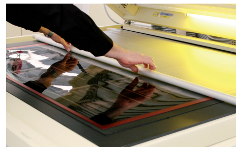
Precise reproduction to printing plate